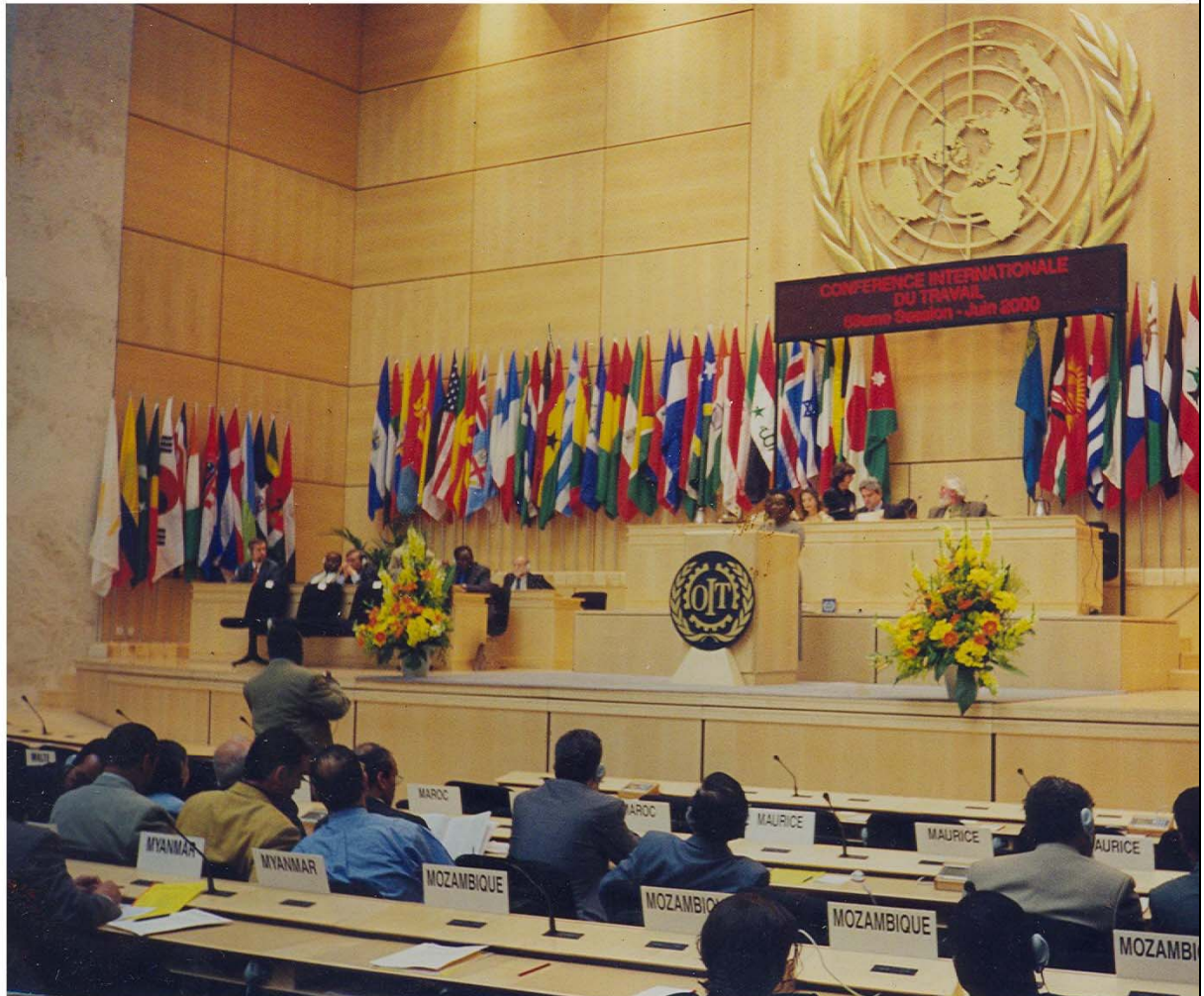
Addressing the plenary in Geneva 2000 at the ILO