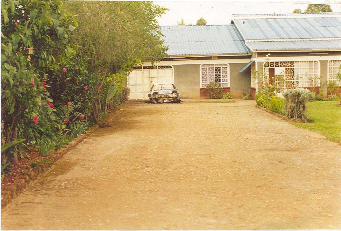
The burnt out shell of my car when arsonist raided my home to curb my political ambition Sept 2006.