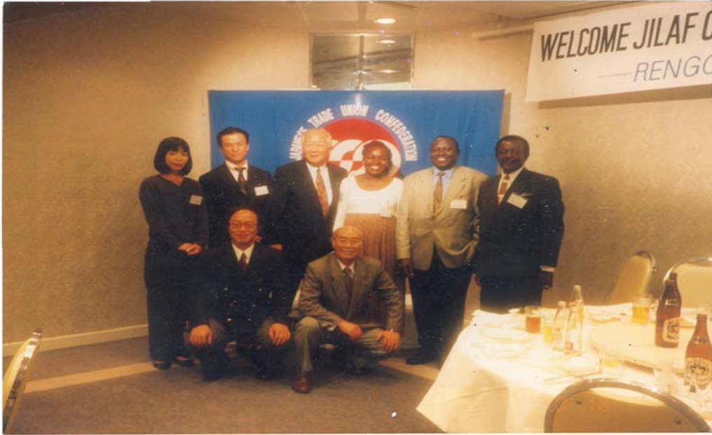
While representing Africa in Japan in 1997 with Japanese Trade Union Confederation.