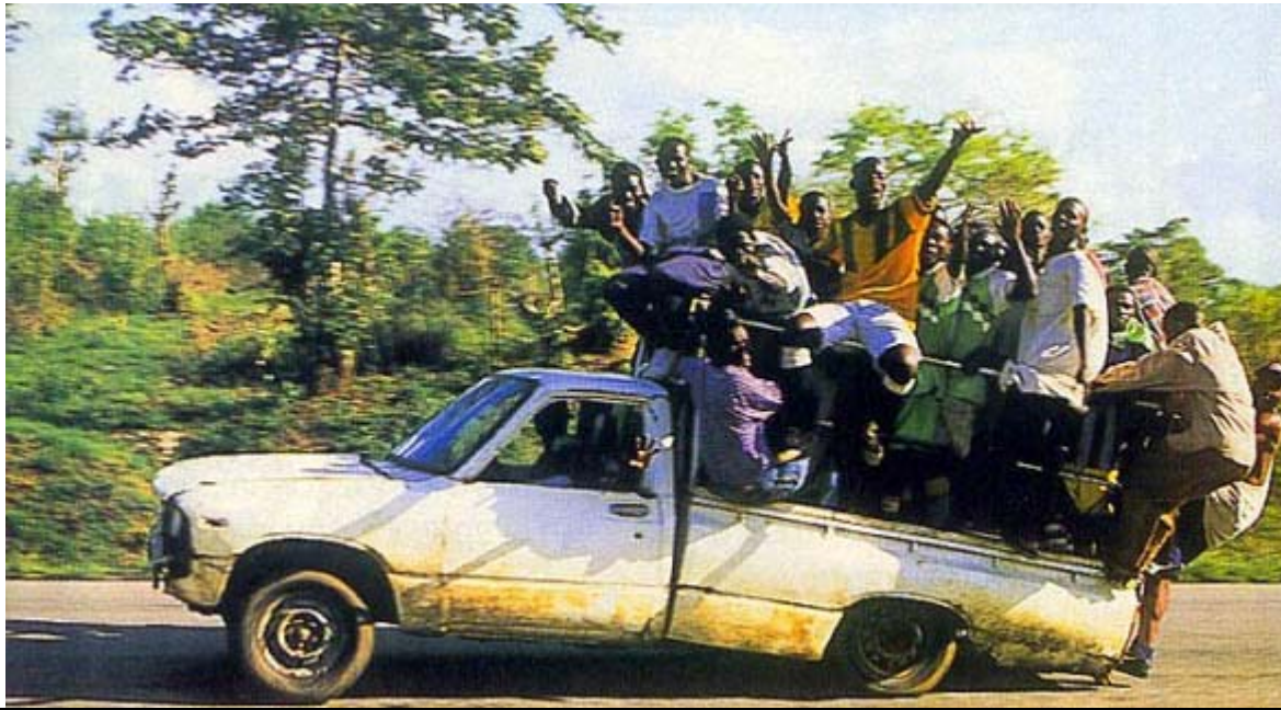
Seen in Buruburu, Nairobi: Engineering “ingenuity”